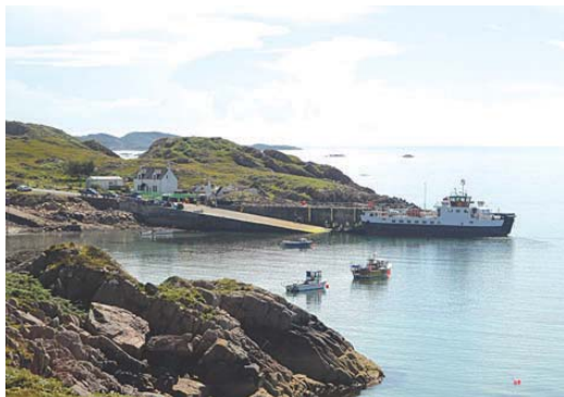
The ferry at Fionnphort

T O VISIT Mull and Iona is to have, literally, a true taste of the West Highlands. With Iona being almost a stone's throw from the foot of Mull the two islands are inextricably linked. A visit to both will give you a detailed insight into early Celtic Christianity and local history and culture. Mull particularly is well-known for its local produce, including cheese, and its wildlife holidays.